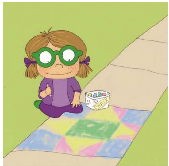
Many parents fail to recognize the early warning signs of Obsessive Quilting Disorder.