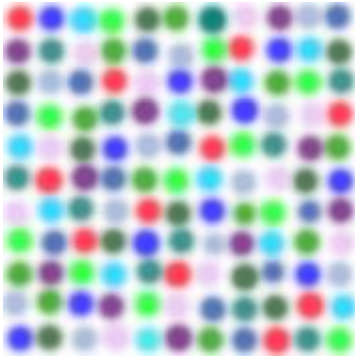
Colors of your choice